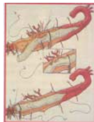
THE CRAWFORD INLAY OPERATION FOR REPAIR OF A THORACO-ABDOMINAL AORTIC ANEURYSM

British Journal of Surgery 1995: 82.148-149